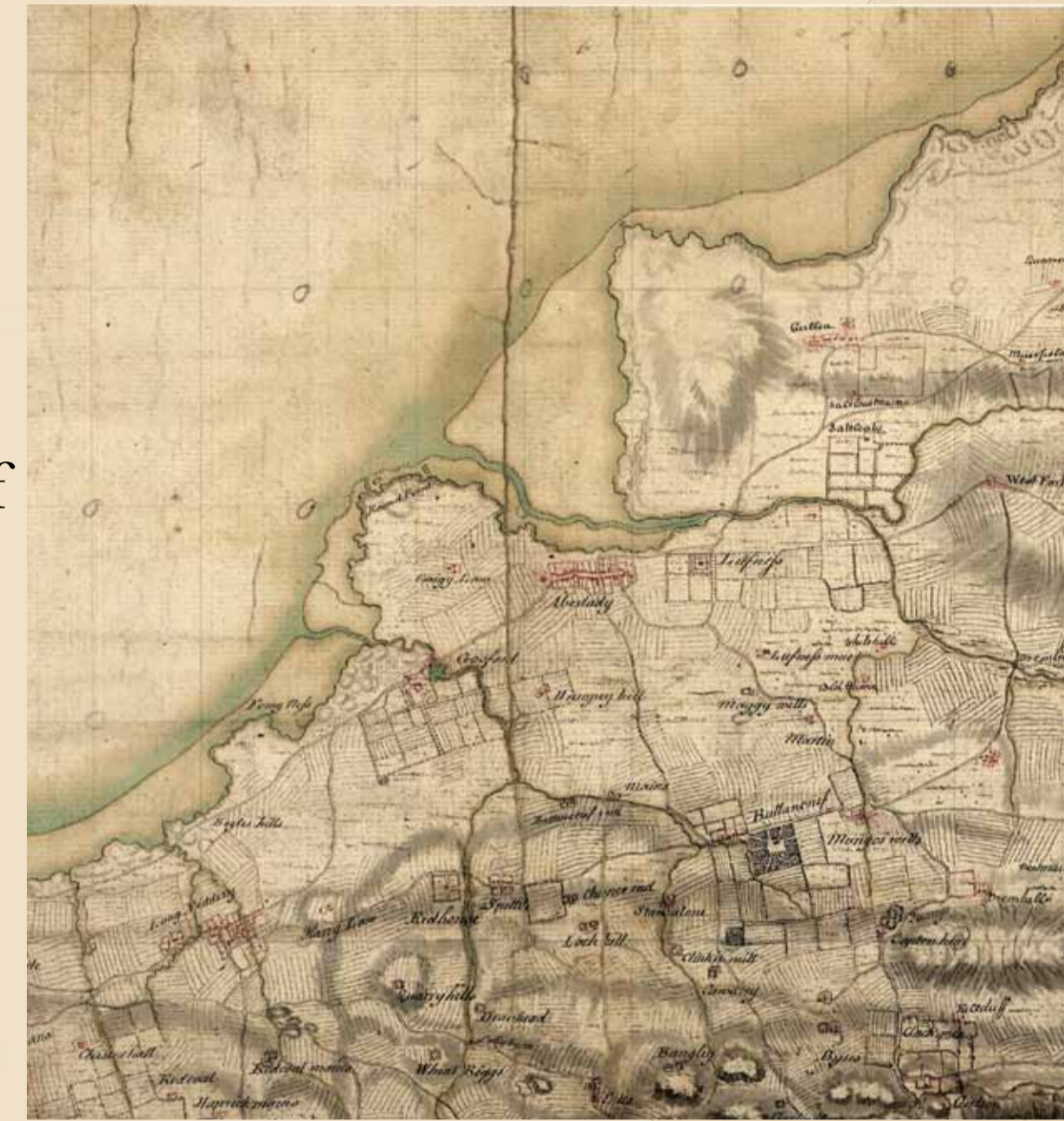
From General Roy's Map of Scotland ca.1755

Francis purchased Gosford, a ‘black desolate spot, without a shrub or a stick near it, staring on the sea shore’, from the Wedderburns of Gosford in 1784. In 1790 he built the stables, to the design of William Newton of Newcastle. In 1789 he asked Robert Adam to design a magnificent New House. In 1790 he commissioned James Ramsay to design and lay out around the New House a vast landscape in the beautiful style, with pleasure grounds, comprising curvaceous lakes, parkland trees, lawns and shrubs, sheltered by woodland and drained by 5 ½ miles of stone sunk fences. North of the lakes to the designs of Thomas Harrison of Lancaster, he built a necropolis, with a 64-niche mausoleum, surmounted by a scaled-down replica of the Great Pyramid, visible along a processional avenue, surrounded by a substantial tenemos wall and sunk fences. West of the New House he planted 11 clumps in crescent formation, and built a park wall and lodges along the coast.